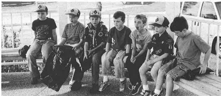
Warrenville: Scouts from Warrenville Pack 68 and Den 13 were a big help in the Warrenville cleanup on Saturdays, April 21 and 28.