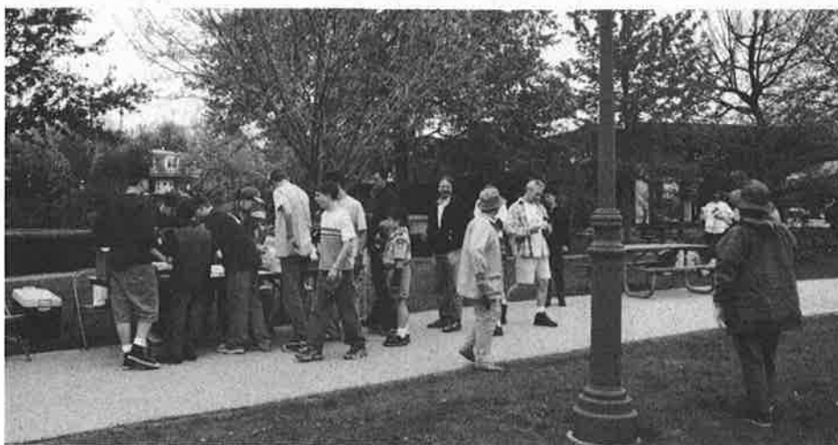
Glen Ellyn: Approximately 145 volunteers registered for the cleanup in Glen Ellyn and over 2,000 pounds of debris were picked up.