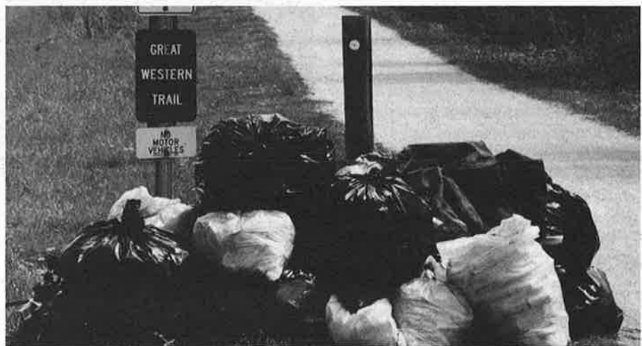
Lombard: Trail litterbags left on the Great Western Trail in Wheaton at Gary Avenue show what a productive cleanup day it was, thanks to the "army of volunteers" who did a great job on Earth Day 2001.